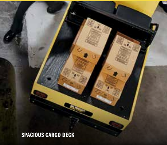
SPACIOUS CARGO DECK