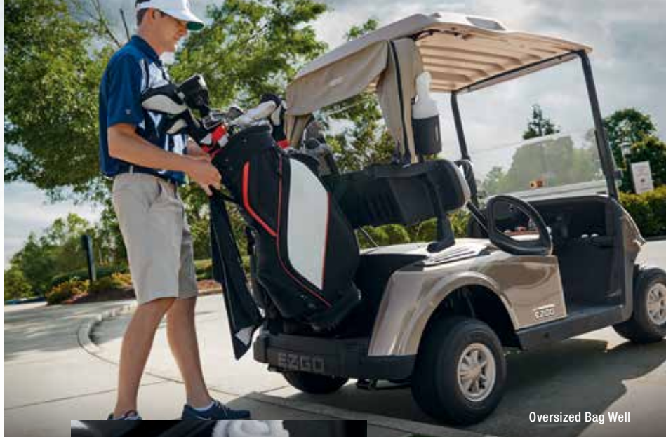
Oversized Bag Well