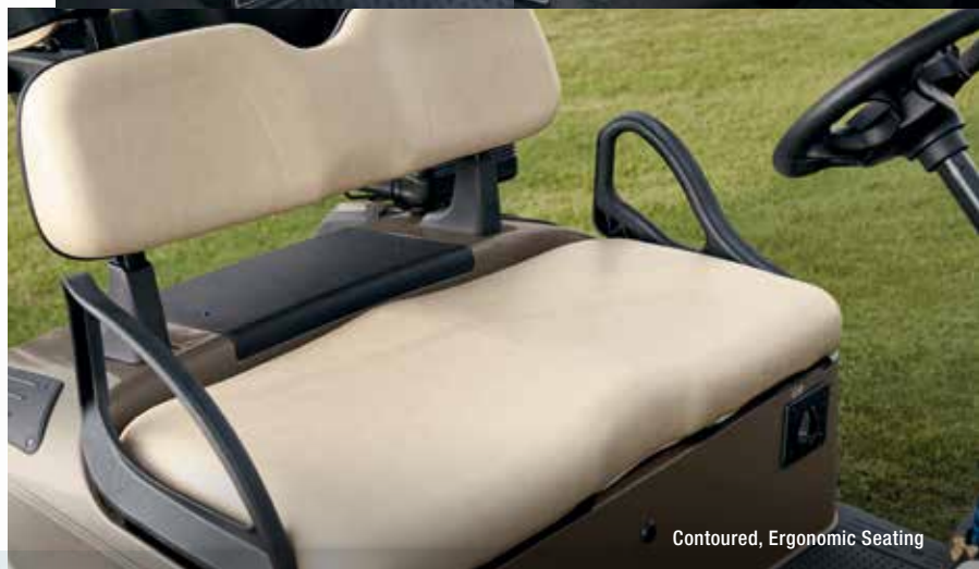
Contoured, Ergonomic Seating