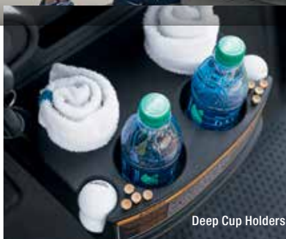
Deep Cup Holders