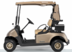
Available in 48-Volt AC Electric and 13.5-hp Gas Options

It's been almost a decade since the RXV first set a new standard for superior golf car performance. After years of customer research and proven innovation it's still on top, combining AC power with the patented AutoBrake system for efficient performance that the competition can't match.