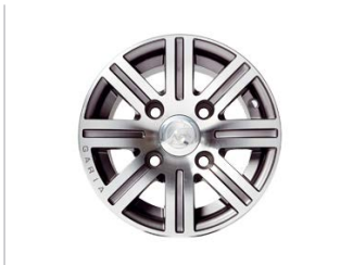
10" DIAMOND CUT