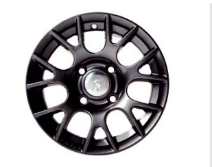
12" GUN GREY