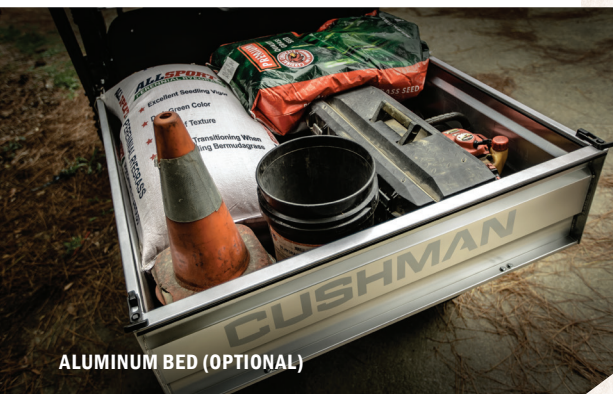
ALUMINUM BED (OPTIONAL)