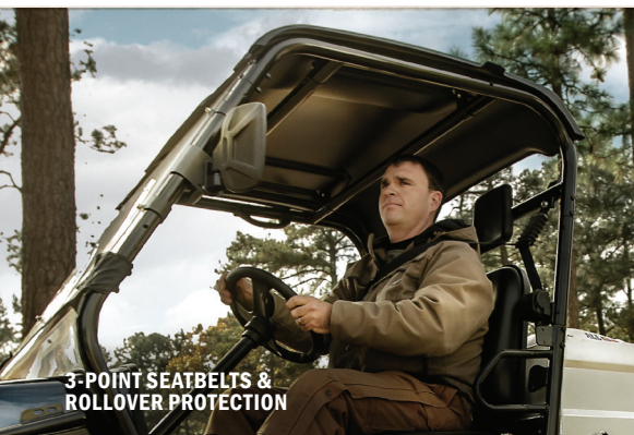
3-POINT SEATBELTS & ROLLOVER PROTECTION